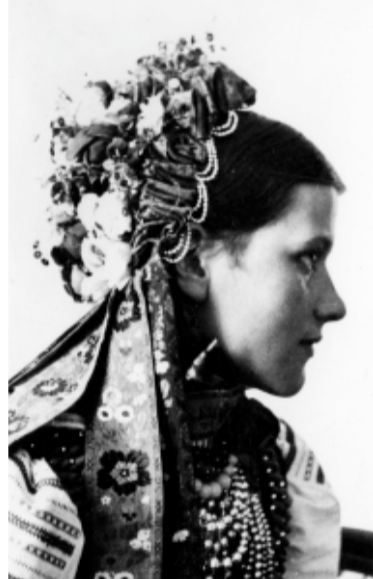
Bride. Krzczonów, Lublin District.