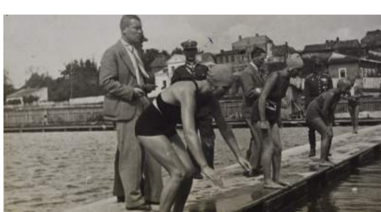
Swimming competition at a swimming pool in Lubomelska Street. Lublin, 1934