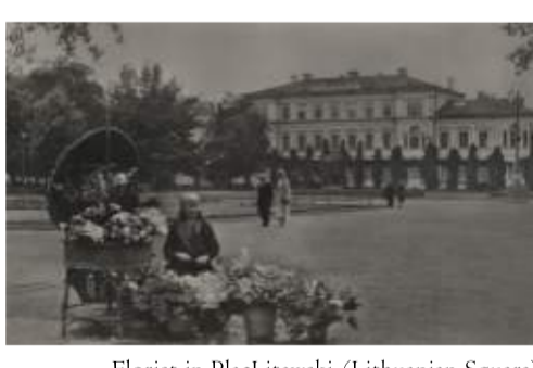
Florist in Plac Litewski (Lithuanian Square). Photo by Zofia Chomętowska, Lublin, the 1930s.