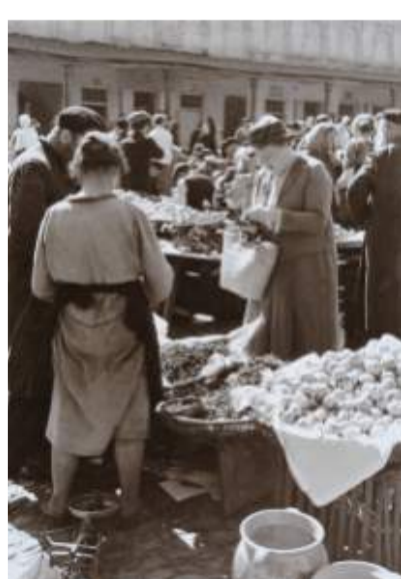
At the market in Lublin, between Lubartowska and Świętoduska Street. the 1930s.