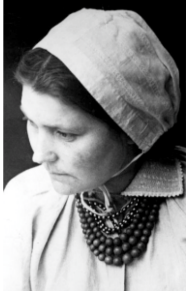
Married woman in a bonnet. Wólka Lubartowska, Lubartów District.