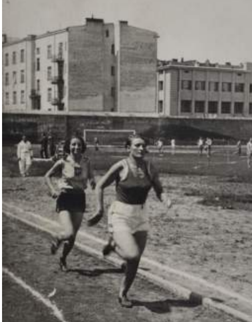
Athletics competition. Lublin, 1930