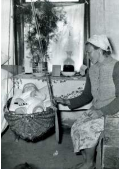
In a cradle. Krasne, Parczew District.