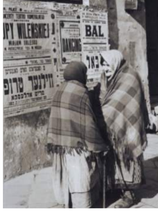
Grodzka Street in Lublin. the 1930s.