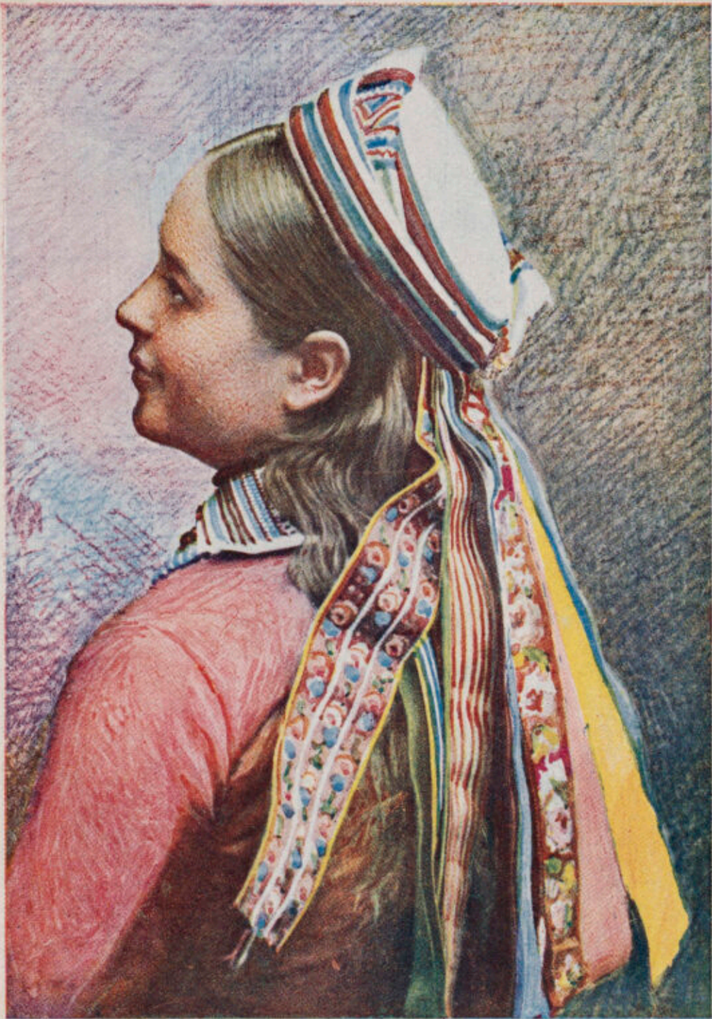
Fot. J. Wasilewski. Lublin.